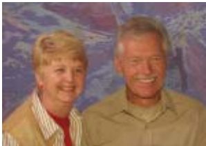
130 Health Kits Wing Their Way to UMCOR's Salt Lake City Depot!